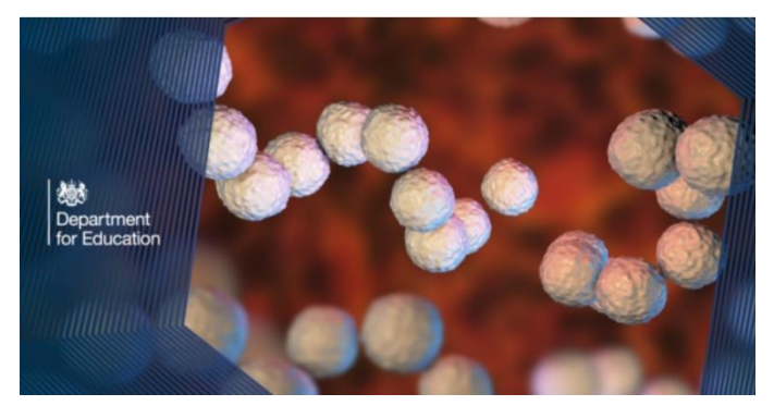
Strep A and scarlet fever – what are they and what are the symptoms? Information for parents, schools, colleges and early years providers